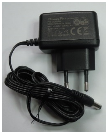
1x Power adaptor