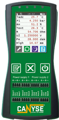
1x Measuring device CANYSE 801