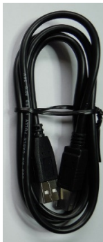
1x USB cable